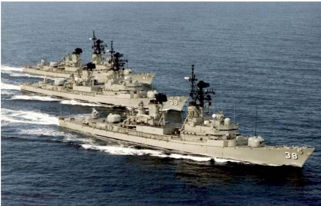
DDGs Hobart, Brisbane and Perth

On June 17 1968 while on duty in Vietnamese waters, Hobart was struck by three Sparrow missiles fired from a USAF 7th Air Force aircraft (one of the three missiles failed to explode). Two crew were killed and several injured. Shrapnel holes were still evident in Hobart's AN/SPG-51C Missile Fire Control radar power supplies as late as the early-mid 1980s .