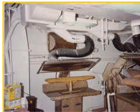
Ventilation for steam-press in laundry area aboard Navy ship

Local exhaust is required for processes such as welding and paint mixing and dispensing in paint storage areas. Specialized, portable exhaust blowers are often required for specific temporary projects such as welding or asbestos removal.