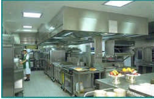
Simple ventilation systems can result from reduced amount of equipment galleys

Since 1997, the Navy has identified and field-tested several types of advanced food service equipment such as: the combination convection oven/steamer, skittle, and clamshell griddle. Advanced food service equipment can replace multiple pieces of traditional food service equipment. Reducing the amount of equipment in the galley also reduces the need for more complicated ventilation systems and their