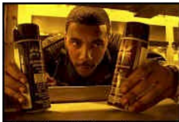
Selecting HM from storeroom

Another common ventilation problem associated with shipboard laundries and galleys is that airborne materials can collect in ducts unless a good pre-filtration system is available and effectively maintained. Large volumes of lint generated in laundries can partially obstruct airflow and serve as potential combustion sources. Grease and other cooking residues generated in galleys that collect in ducts can also become combustible. Ventilation duct fires are extremely difficult to extinguish.