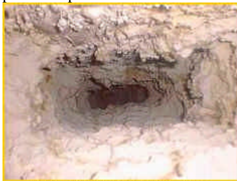
Buildup of dirt obstructs airflow through ventilation system

Ventilation systems include a supply, or makeup air system and an exhaust system. Supply systems replace contaminated air exhausted from a workspace with uncontaminated outside air. Supply ventilations systems also provide replenishment air to air conditioning recirculation systems. Exhaust systems remove odors, heated air, and airborne contaminants from the workspace. Both supply and exhaust airflow quantities must be balanced.